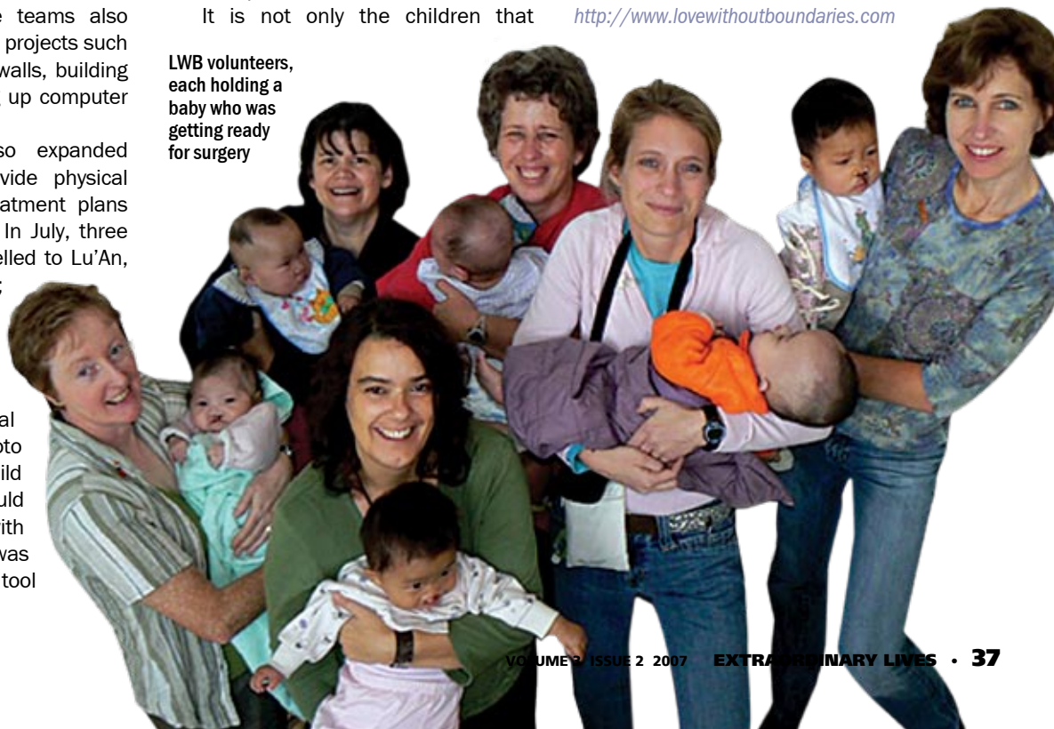
LWB volunteers, each holding a baby who was getting ready for surgery

Love Without Boundaries 306 S Bryant, Suite C PMB 145 Edmond, OK 73034 USA Phone: 405-216-5837 email: Info@lovewithoutboundaries.com website: http://www.lovewithoutboundaries.com